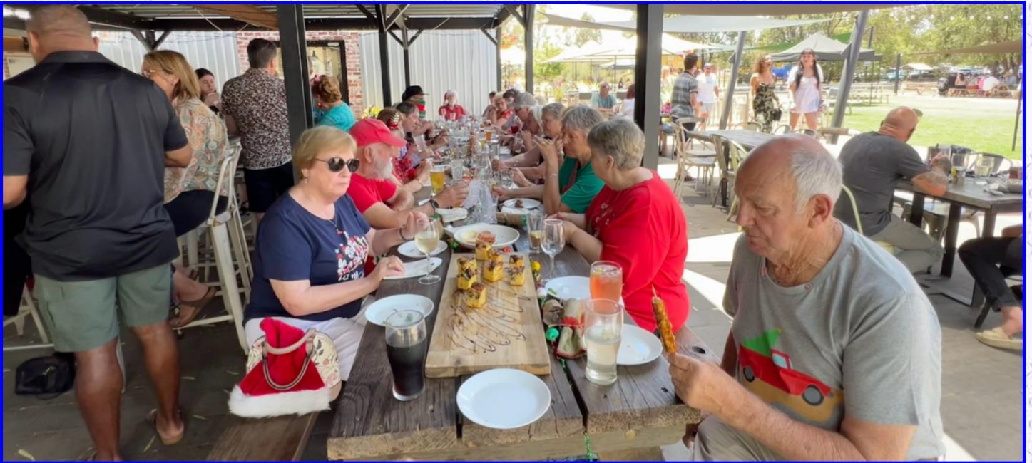
Pictures from our Christmas meeting held on Sunday 3 rd December at King Road Brewery