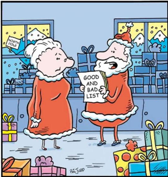
"Apparently there's no good or bad children anymore...only misunderstood!"

Mike was in the garden filling in a hole when his neighbour peered over the fence. Interested in what the old fella was up to, he politely asked, "What are you up to there, Mike?" "My goldfish died," replied Mike tearfully without looking up, "and I've just buried him." The neighbour was concerned. "That's an awfully big hole for a goldfish, isn't it?" Mike patted down the last heap of earth, then replied, "That's because it's still inside your cat!"