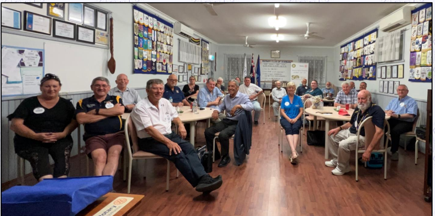
Club meeting at Rotary Hall, Monday 11 th December 2023