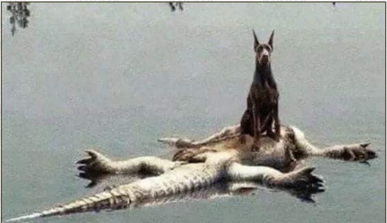
He took my squeaky toy