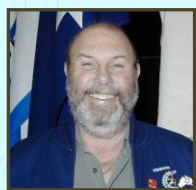
PP Ian Critchley Foundation