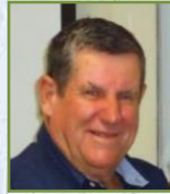
PP Max Bird Foundation Dir.