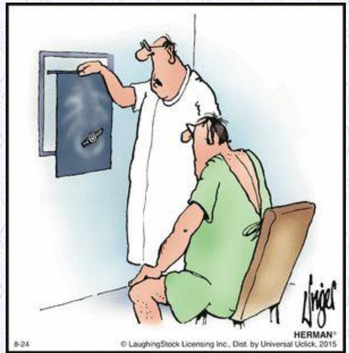
"I'll have to open you up again; that watch has great sentimental value."