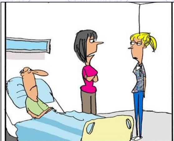
"I'm a close relative, and I did some research on the Internet about his condition, so I feel I'm more qualified to take care of him than some nurse."