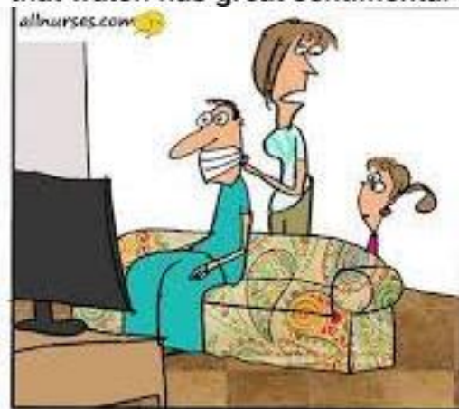
"Since your dad is a nurse, he can't stop pointing out all the mistakes in my favorite nursing TV show. So, I have to put him on mute."