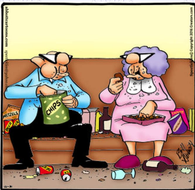
"Hurry! Our New Year's resolutions start in ten minutes."

The island nation Kiribati in the Central Pacific is the first location to ring in the new year each year.