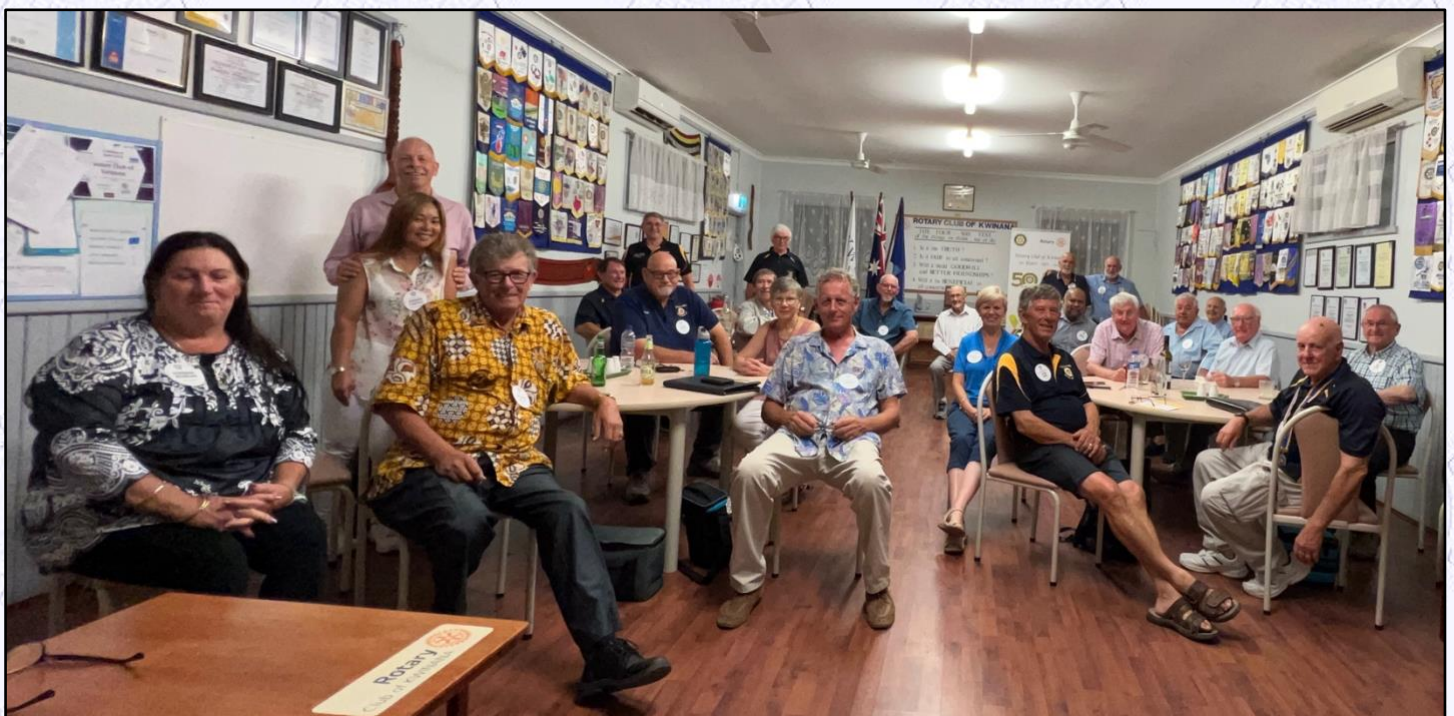
Club meeting at Rotary Hall, Monday 08 th January 2024