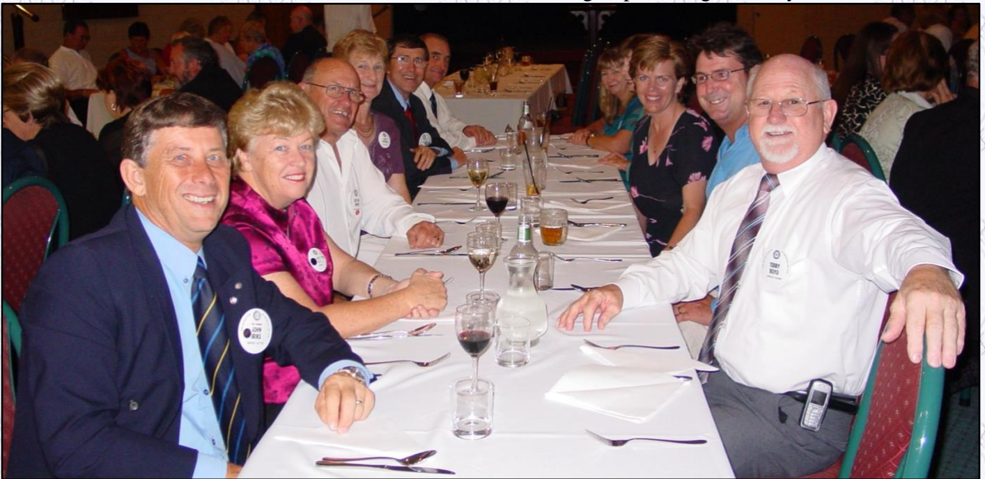
Joint group meeting February 2006