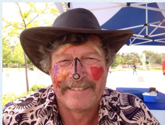
A good sport for letting an amateur face-painter practise her skills!