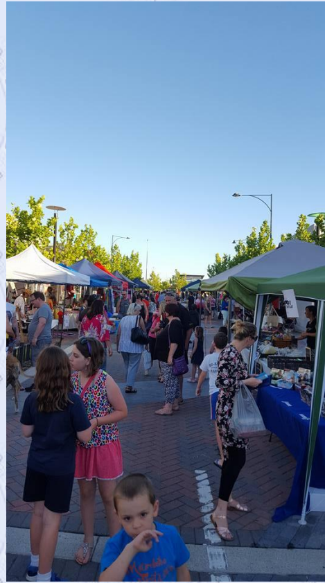
Our most successful markets to date!