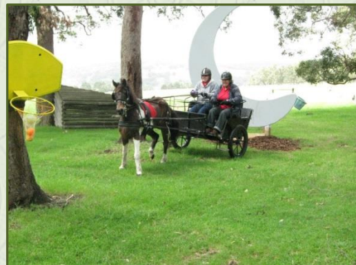
Riding for the Disabled at Baldivis, are on Facebook