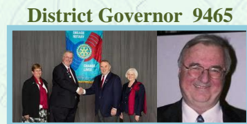
District Governor 9465