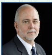
Rotary International President 2018/19

Ed is currently recovering in hospital from a very recent technical neck operation, speedy recovery mate.