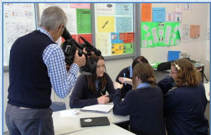
Comet Bay College students discuss how best to tackle the project