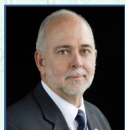
Rotary International President 2018/19