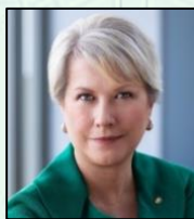
Rotary International President 2022/23 Jennifer E Jones

Cheese and Wine Night, scheduled for Saturday 24 th February.