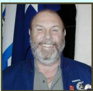
PP Ian Critchley Foundation