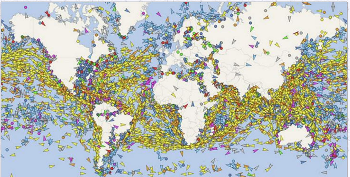
Image below taken from a maritime website shows ships at sea around the world