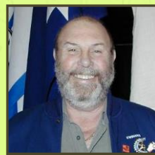
PP Ian Critchley Foundation