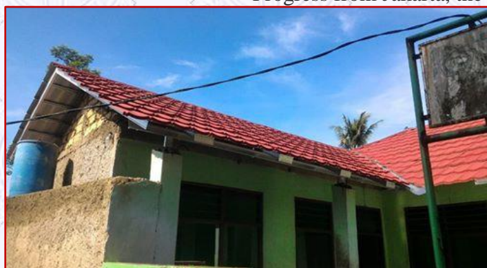
Progress from Jakarta, the new school roof completed