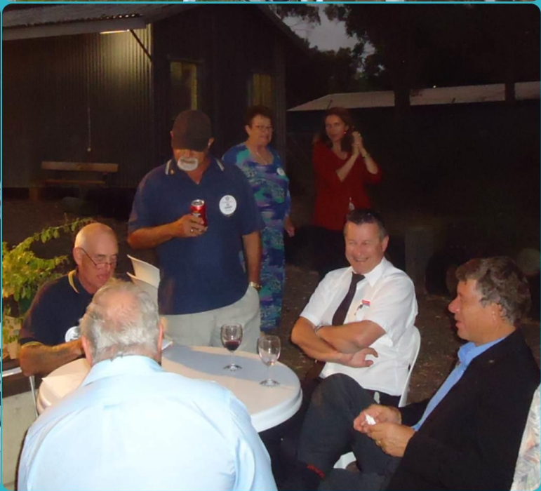
BBQ Meeting held on Monday 11 th January 2016