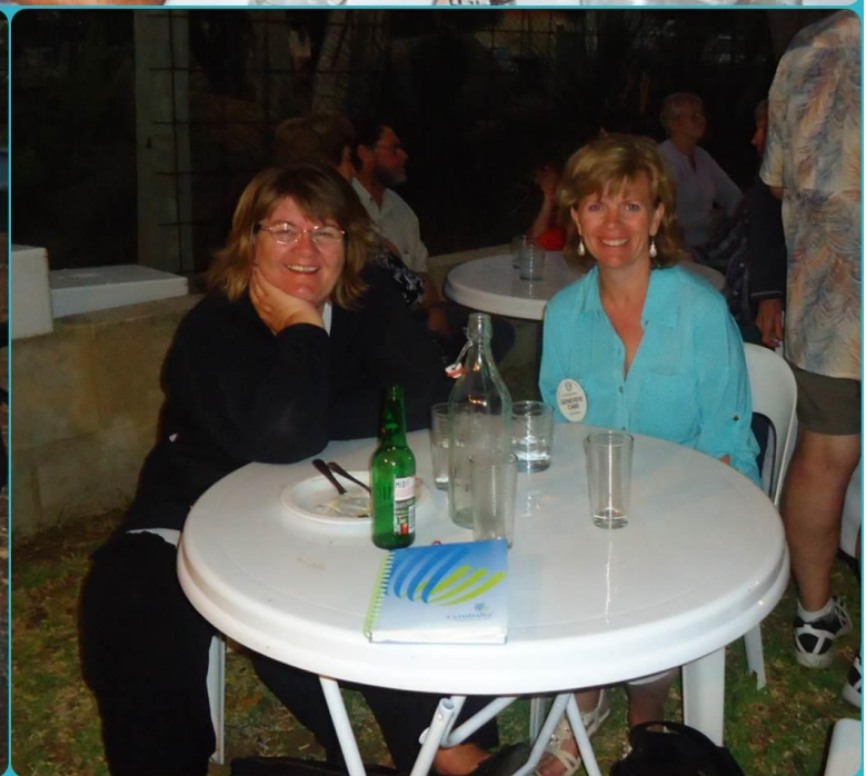
BBQ Meeting held on Monday 11 th January 2016