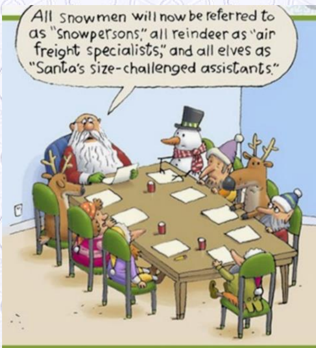
The Year Santa Hired a Consultant