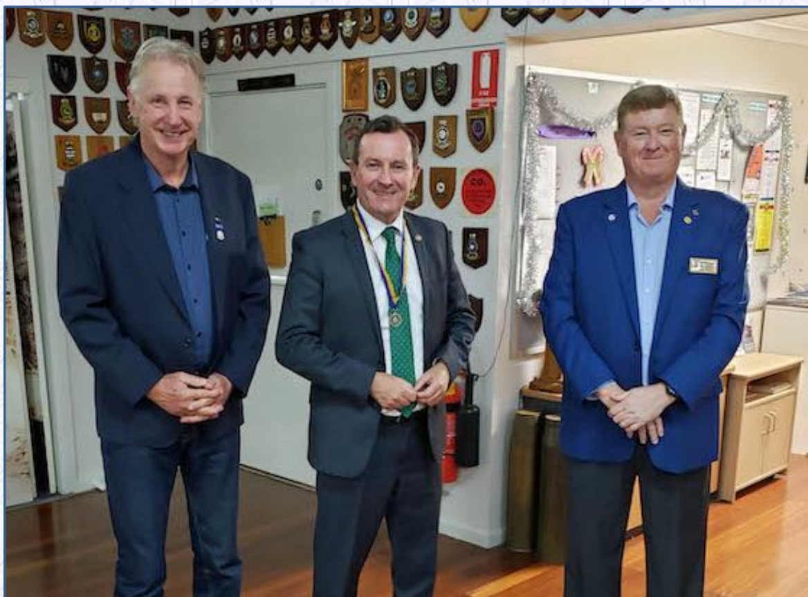
WA Premier Mark McGowan is awarded a PHF by the Rotary Club of Rockingham