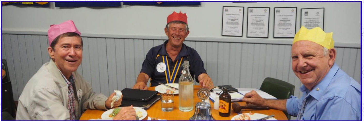
The Christmas spirit was with us, courtesy of some paper hats left by Inner Wheel