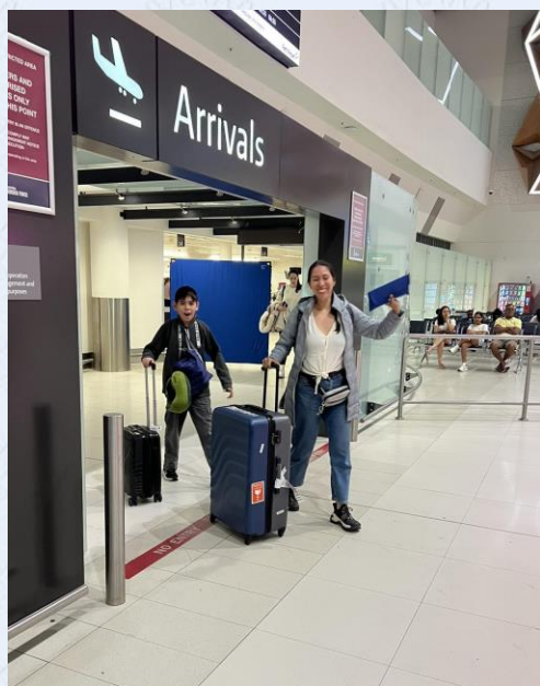
Arriving here early January 2026