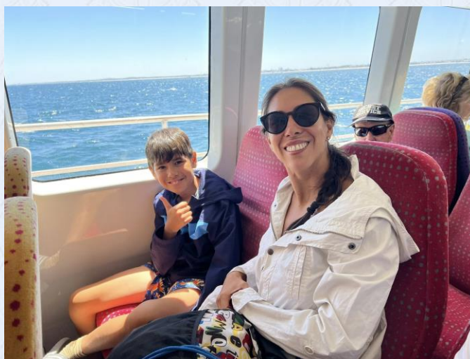
Day trip to Rottnest Island