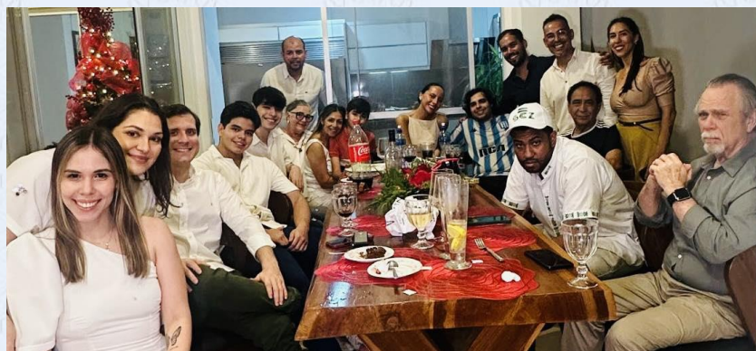
Family photo back home in Bolivia