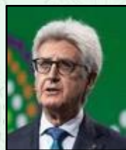
Rotary International President 2025/26

Visitors are welcome Contact 0400 837 603