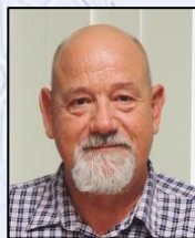
Peter Schulz Vocational