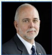
Rotary International President 2018/19