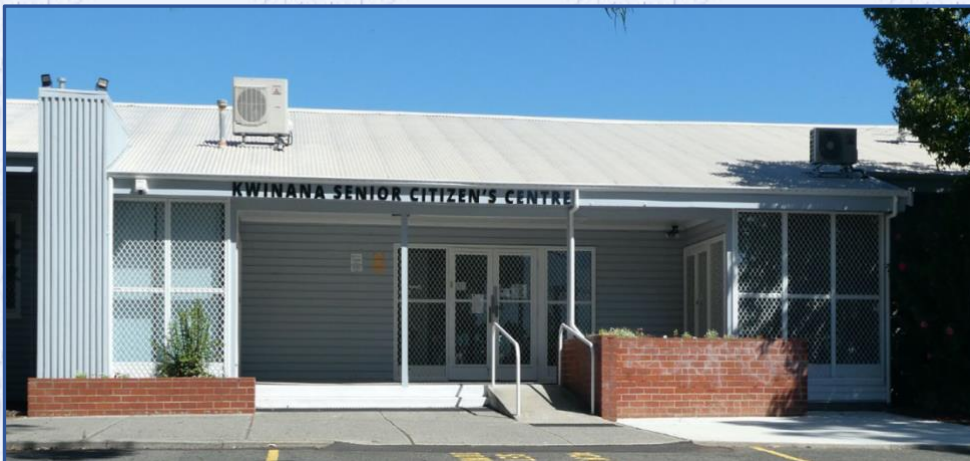
Kwinana Senior Citizens Centre Today