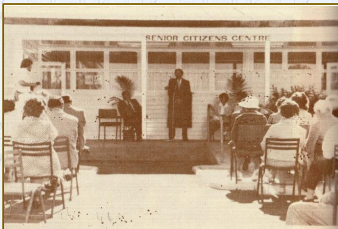
Kwinana Senior Citizens Centre Official opening. 1972