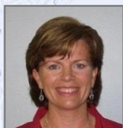
PP Genevieve Carr Youth

Bread Program underway for 2024 Breakfast Club always in need of more assistance. PP Greg recently took a quantity of used car batteries to the recycler.