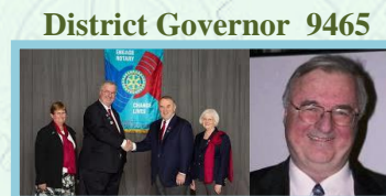
District Governor 9465