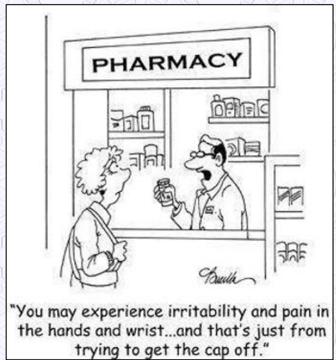
"You may experience irritability and pain in the hands and wrist...and that's just from trying to get the cap off."