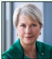
Rotary International President 2022/23 Jennifer E Jones

We have entered the final 5 months of District 9465, I understand we are progressing satisfactorily to becoming Rotary WA 9423 on July 1 2023.