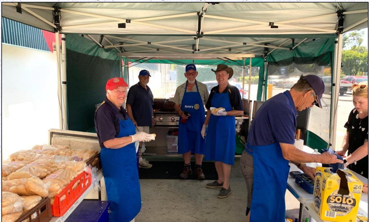
The morning crew at Bunnings Rockingham Sunday 12 th February 2023