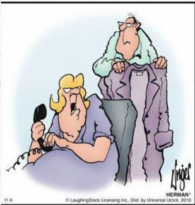
11-9 "How do you feel about me going to my sister's for two weeks?"