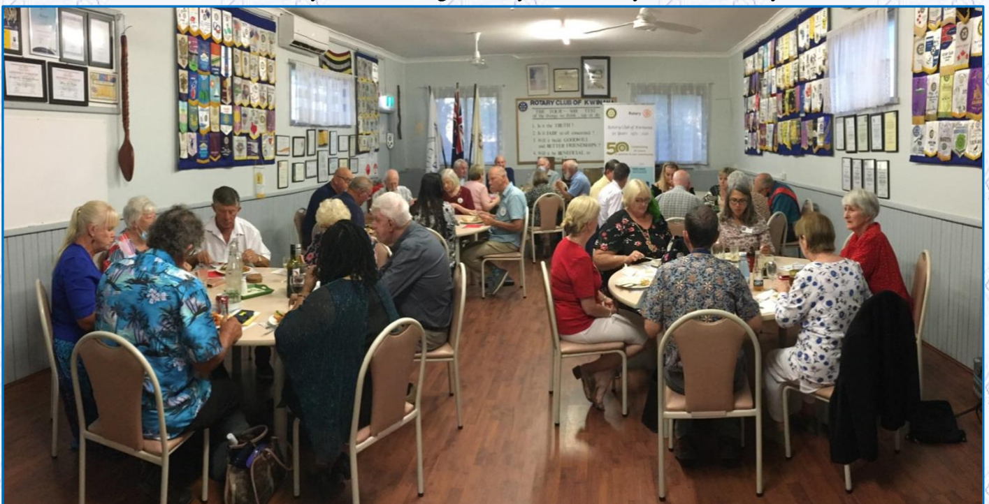
Kwinana Rotary Club meeting Monday 17 th January 2022 at Rotary Hall