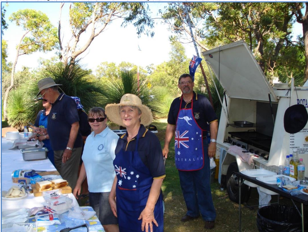
Blast from the past: Our first Australia Day Breakfast, 2008. Outside the Council Office

Responds to the disaster of contaminated water with 'Safe Water for Every Child' by providing SkyHydrants to schools and communities.