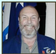
PP Ian Critchley Foundation