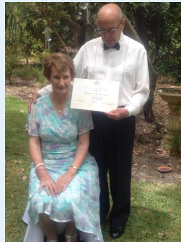
A beautiful couple!