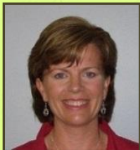
PP Genevieve Carr Vocational