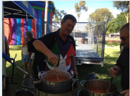
A very committed Rotarian!