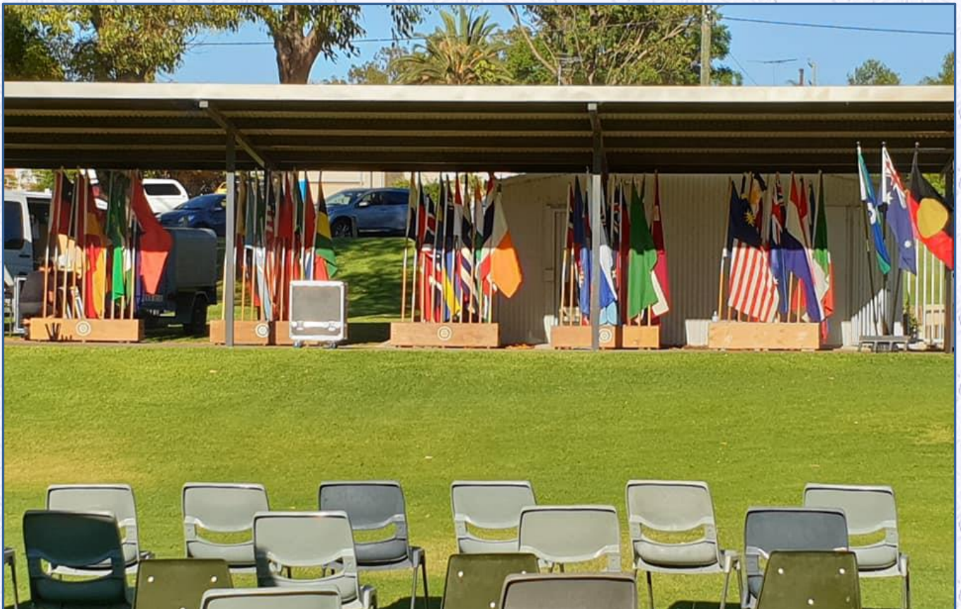
Flags of the world displayed on Australia Day 2022 at Calista Oval