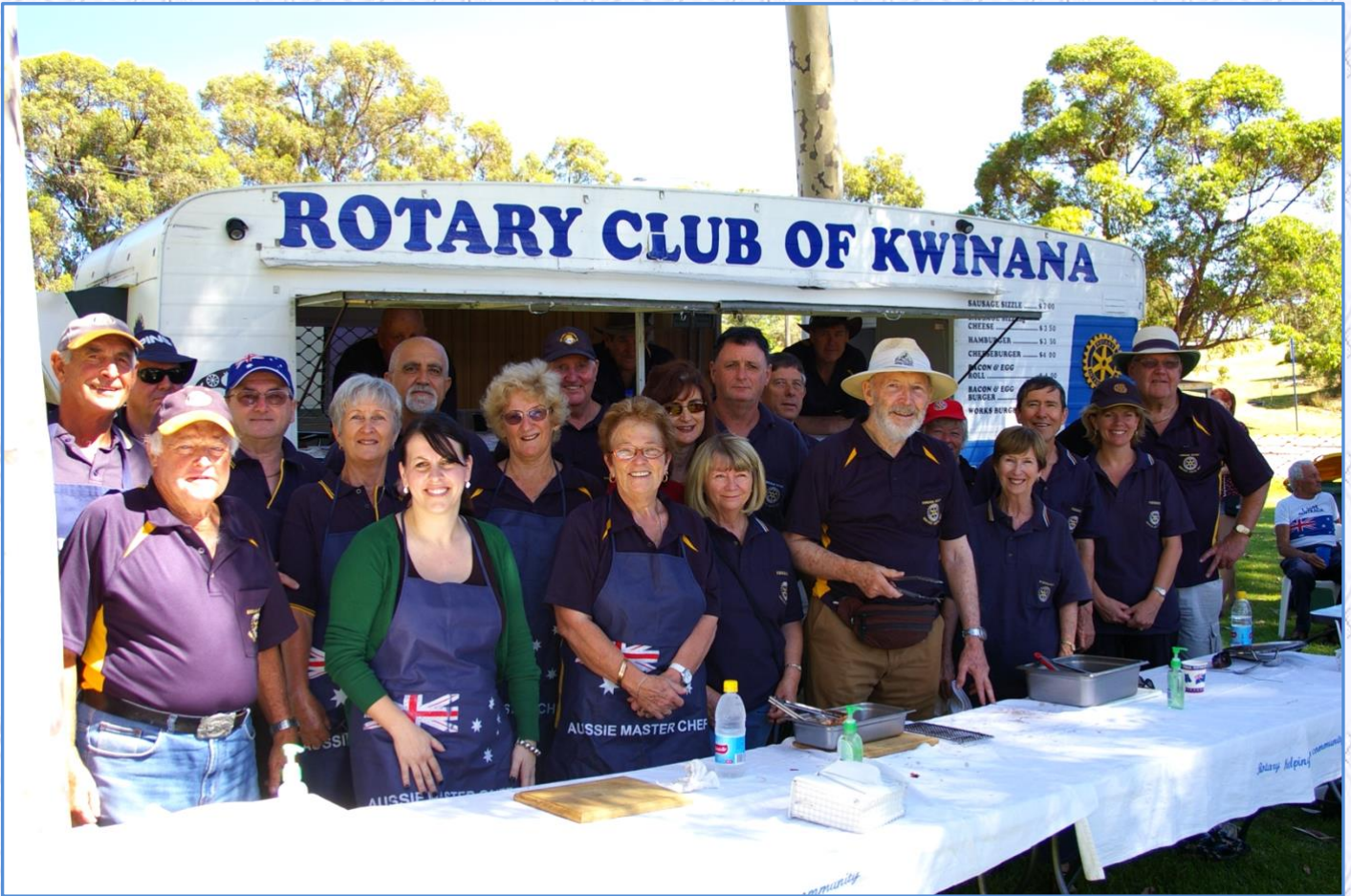
Our first Anzac Day Breakfast 2012