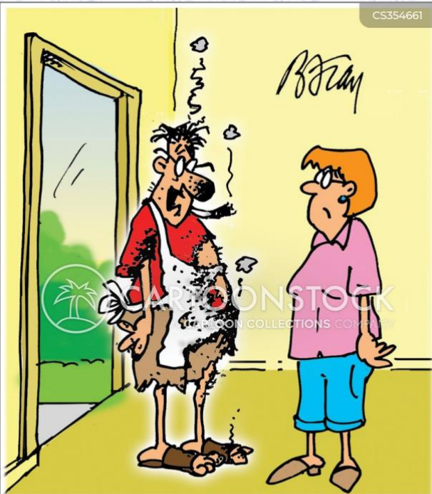
"SO, HONEY, I WAS THINKING, INSTEAD OF BARBECUED STEAKS WHY DON'T WE JUST ORDER IN A PIZZA?!"