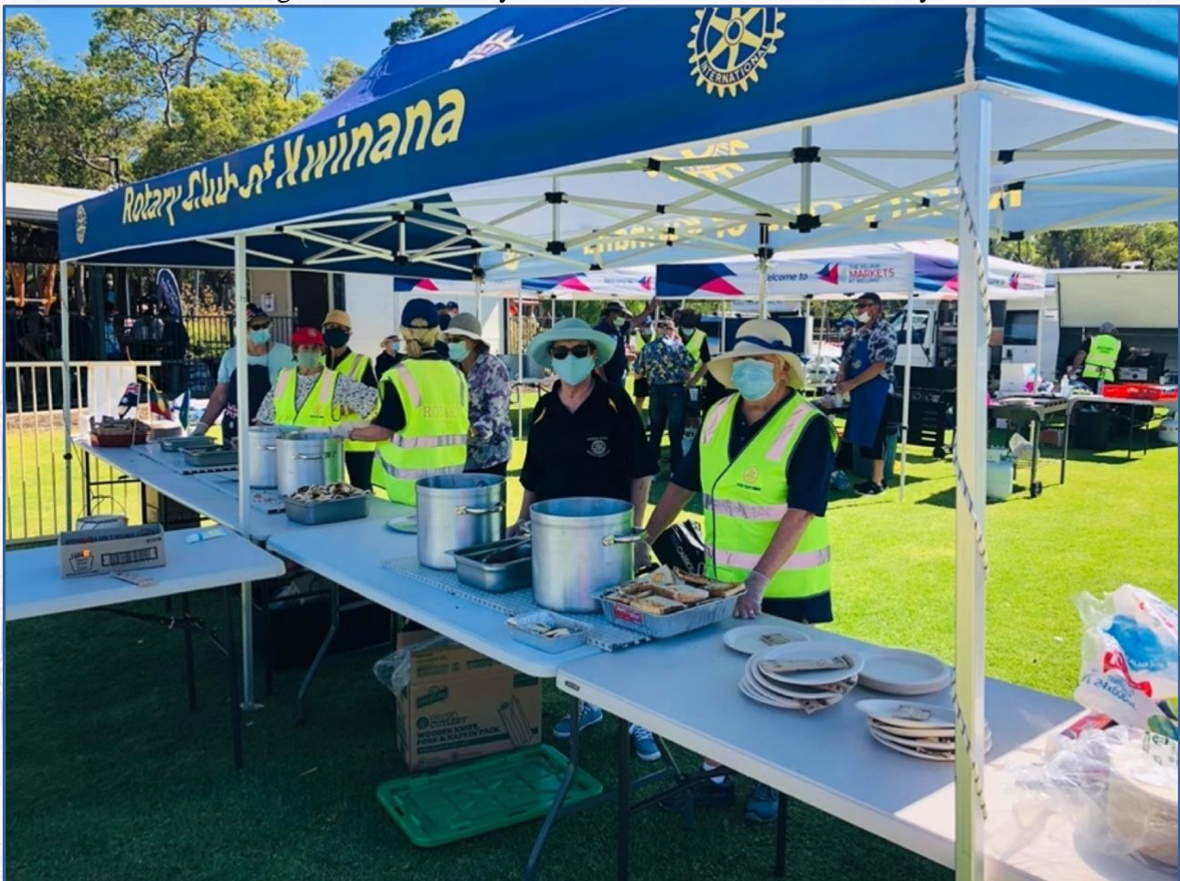
The serving station manned by ladies who wished to remain anonymous