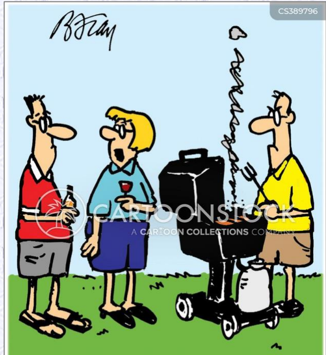
"HOW WOULD YOU LIKE YOUR STEAK... OVERCOOKED, BURNED TO A CRISP OR COMPLETELY INCINERATED?"