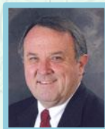
Rotary International President Ron D. Burton

Went along with club members, partners and representatives from the Homestead Ridge Progress Assoc. to Phoenix Energy for a presentation on their proposed 'Waste to Energy' plant in Kwinana, a brilliant concept, one wonders why it took so long to be adopted in Australia. For example Denmark, a country of 5.5 million people has 27 of these plants and almost zero 'landfill' According to ABS almost 50% of all waste in Australia will end up in 'landfill' surely not a statistic we can be proud of!! or allow to continue.