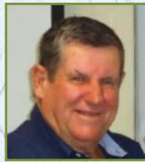
PP Max Bird Foundation Dir.