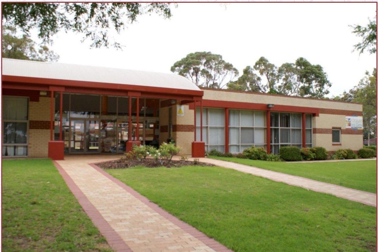
Koorliny Arts Centre, formally Kwinana Community Arts Centre

A "Guess who is coming to dinner" Club social is being arranged for Saturday 19 th March. Please let me know whether you will be attending and if you will be volunteering as a host on the evening.