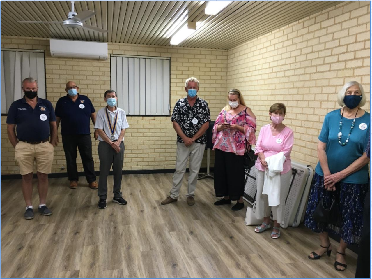
Koorliny Art Centre Monday 14 th February 2022