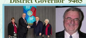
District Governor 9465