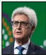
Rotary International President 2025/26

Several of our recently resigned members were also long-term members.