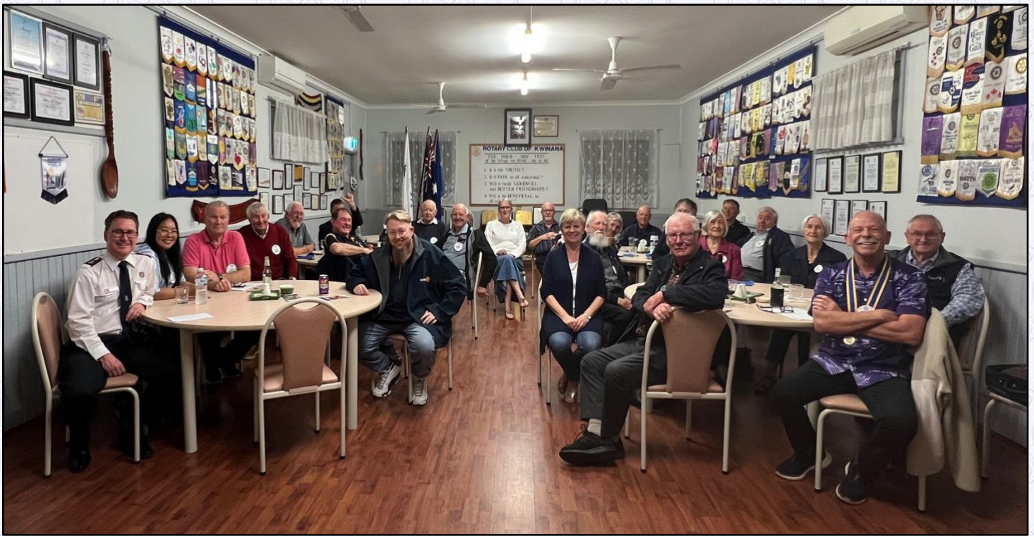
Meeting at Rotary Hall Monday 20th April 2026