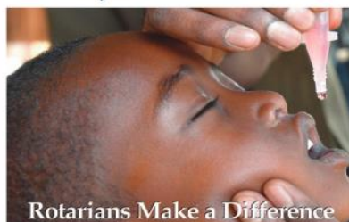
Rotarians Make a Difference

Rotary builds peace through its single largest and most significant project: PolioPlus. To date, Rotarians worldwide have contributed more than $1 billion toward the eradication of polio. Polio once infected more than 350,000 children annually. In 2011, only 650 cases were reported, and in 2012 only 223.