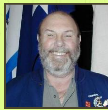
PP Ian Critchley Foundation