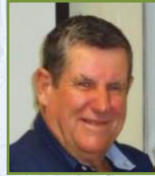
PP Max Bird Foundation Dir.