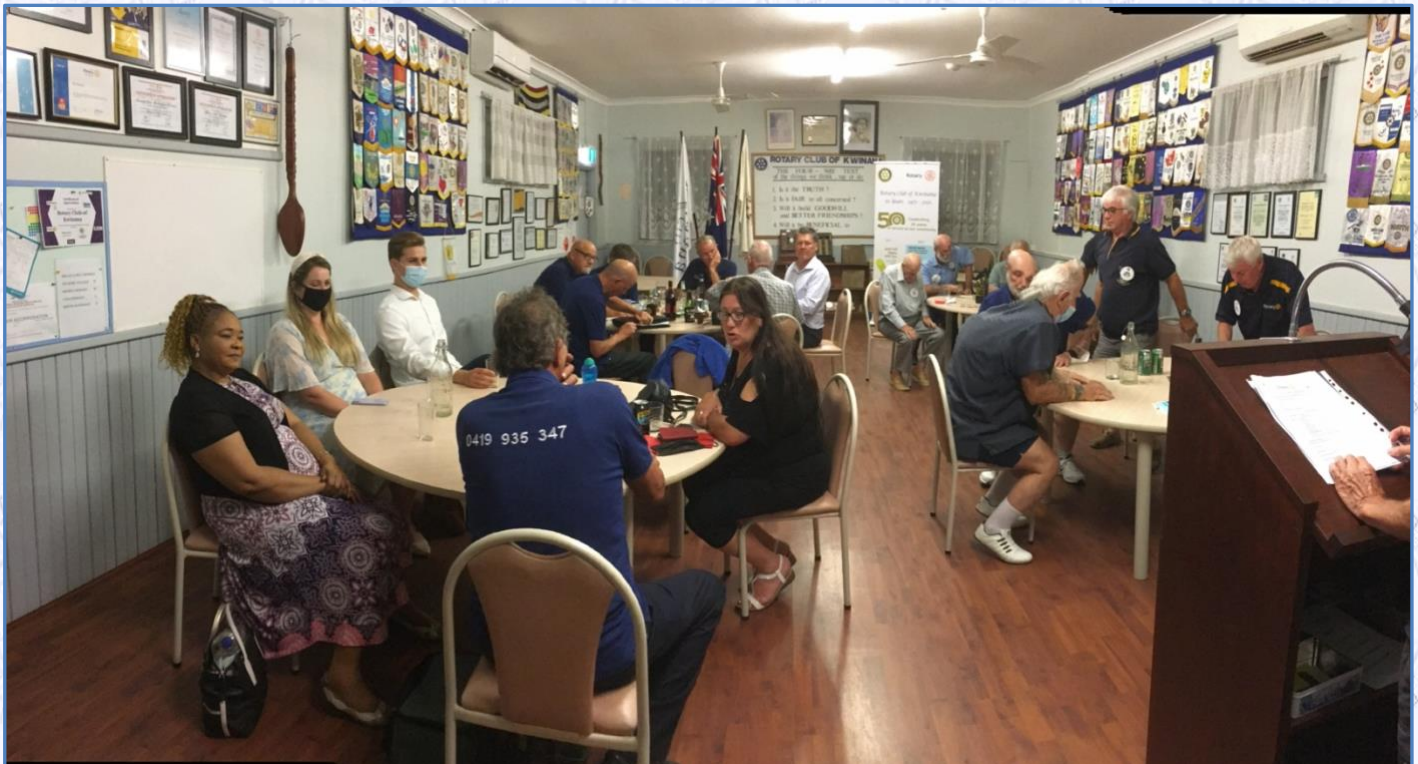
Club Meeting at Rotary Hall, Monday 21 st February 2022