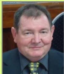
Garry Bassett Vocational

Sausage Sizzle for MACC (Medina Aboriginal Cultural Community) 40 th Celebrations on Saturday 8 th March 2014, catered for 200 from 11am till 2 pm, all went well.