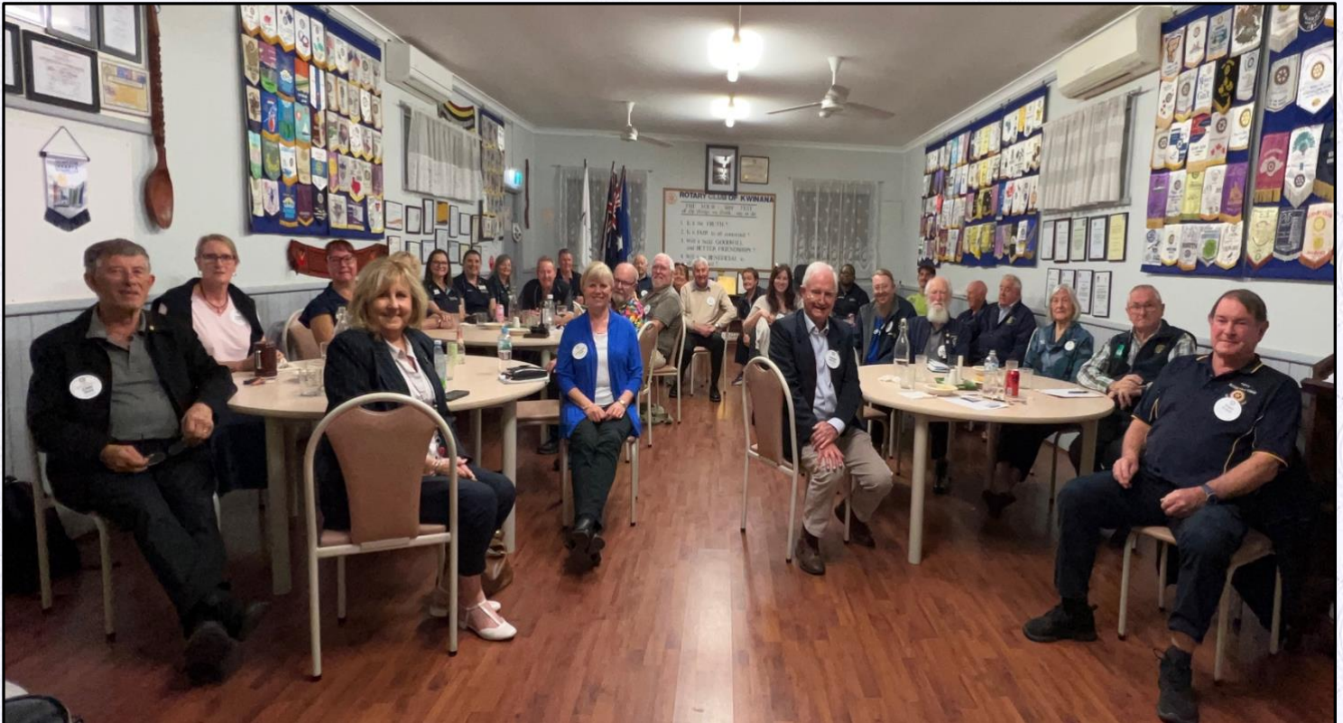
Meeting at Rotary Hall Monday 11th May 2026