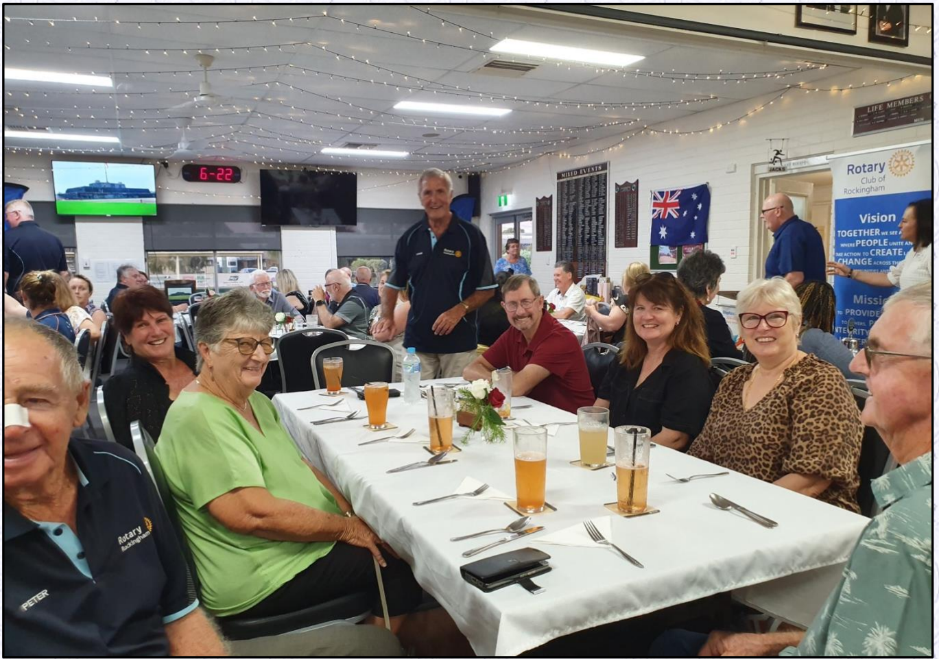
Joint meeting at Safety Bay Bowling Club, Monday 24 th March 2025