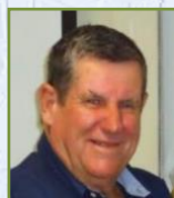
PP Max Bird Foundation Dir.