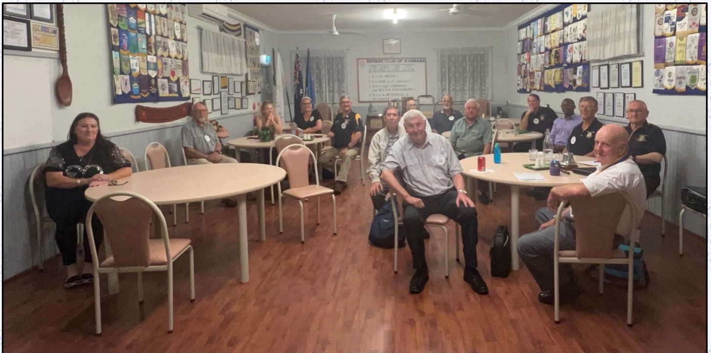
Meeting at Rotary Hall, Monday 15 th April 2024