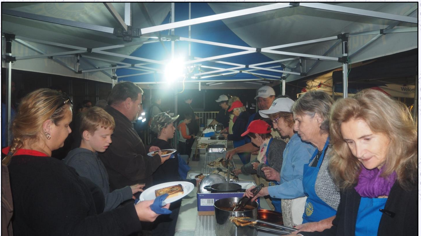
Anzac Day Gunfire Breakfast at Medina Hall 2019 A tradition that sadly, is no longer supported in Kwinana.