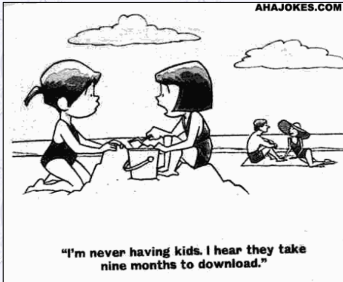
"I'm never having kids. I hear they take nine months to download."