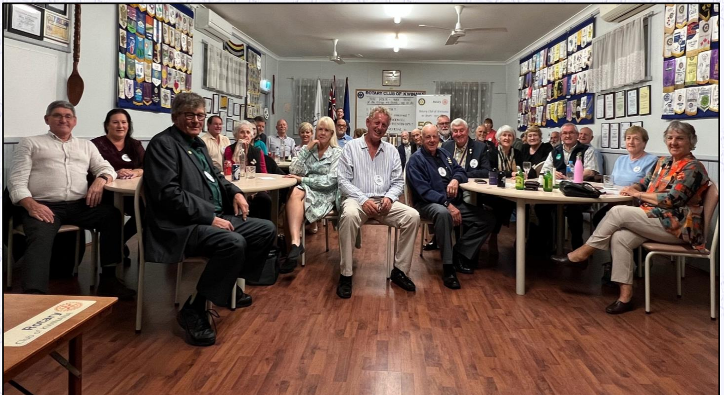
Rotary Club of Kwinana meeting Monday 17 th April 2023 at Rotary Hall