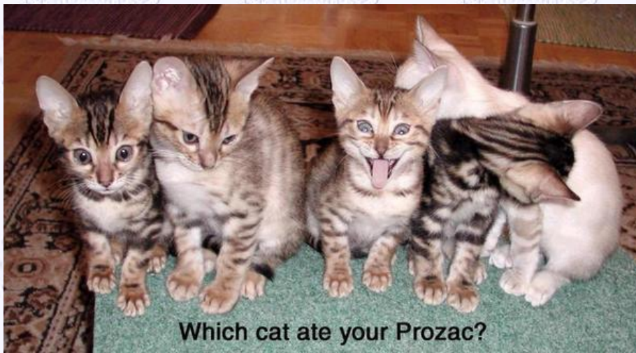
Which cat ate your Prozac?