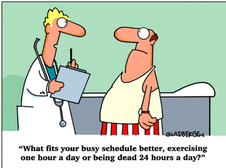
"What fits your busy schedule better, exercising one hour a day or being dead 24 hours a day?"

It's just a lamp. What did you think it was?