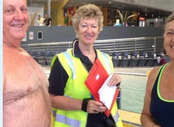
A very sociable couple!