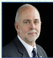
Rotary International President 2018/19

Easter coming up, no meeting on Monday 22 nd