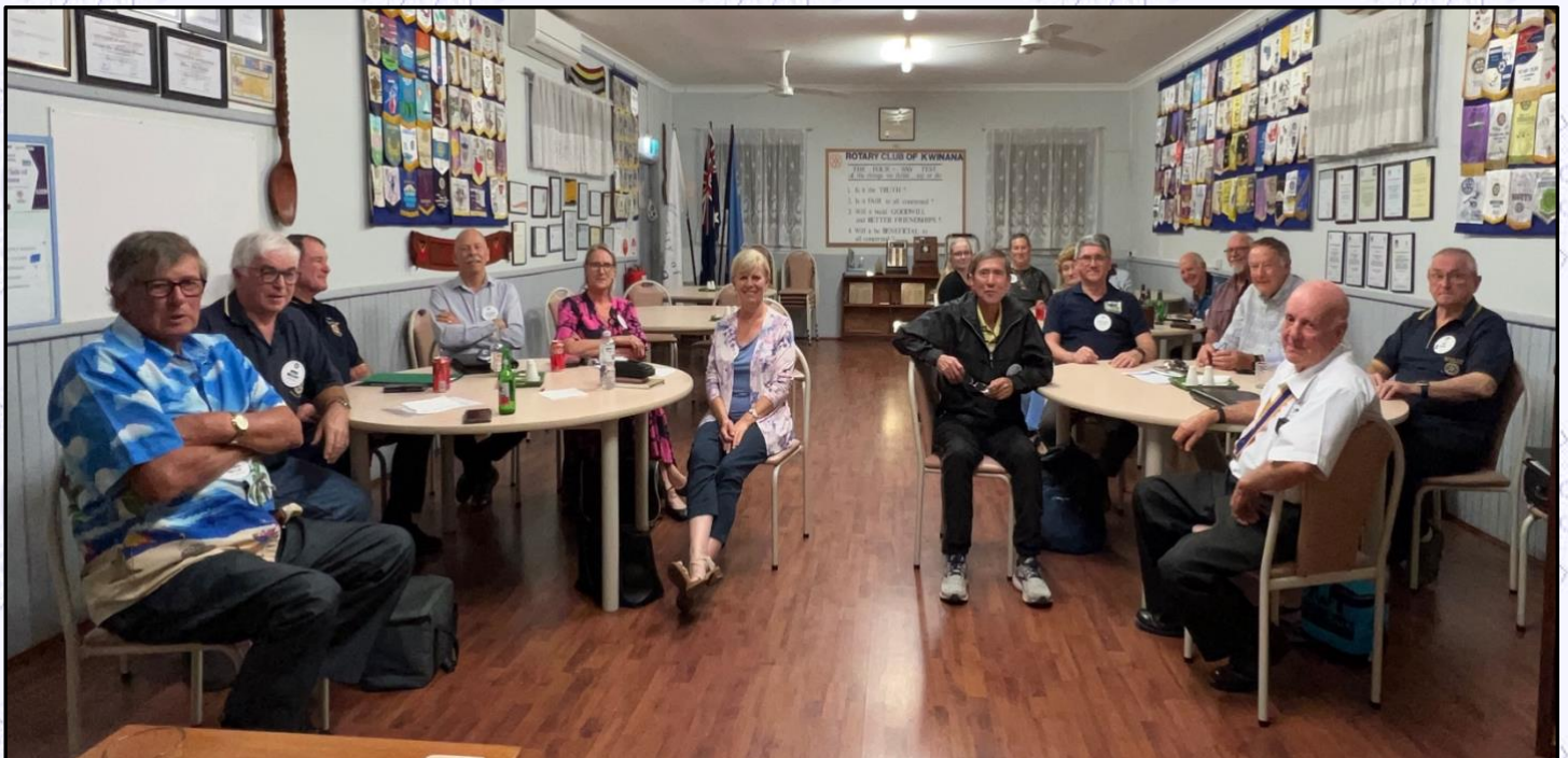
Meeting at Rotary Hall, Monday 22 nd April 2024