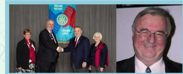
District Governor 9465