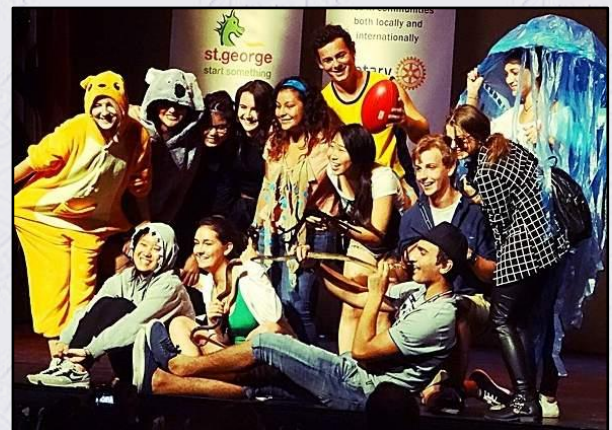
Youth Exchange 'skit'