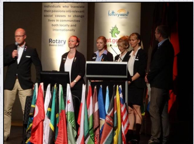
Danish GSE Team presenting at Conference