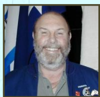
PP Ian Critchley Foundation