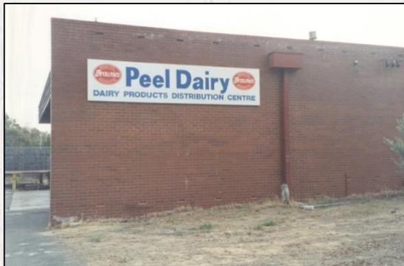
Peel Dairy, Gentle Road, 1996