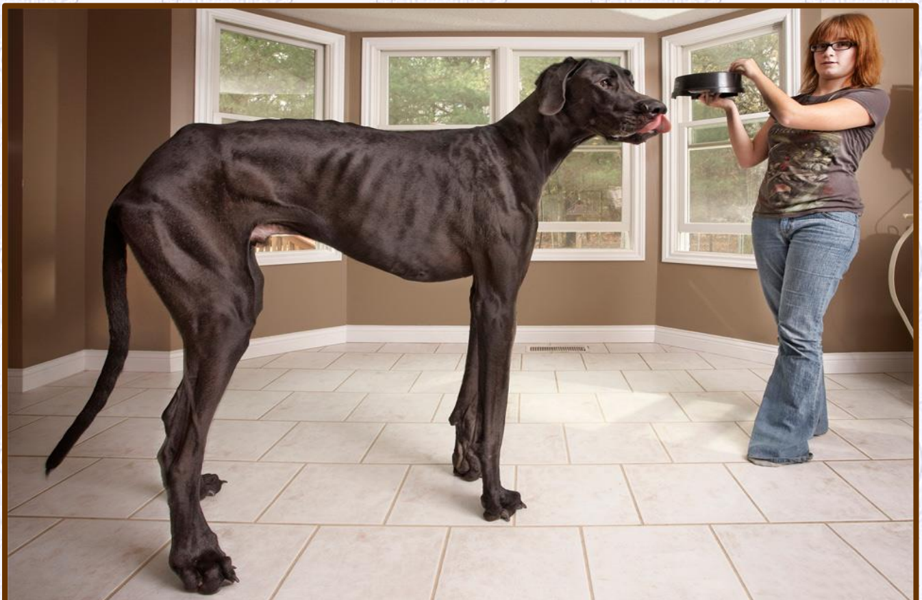
Tallest dog in the world, Great Dane Zeus