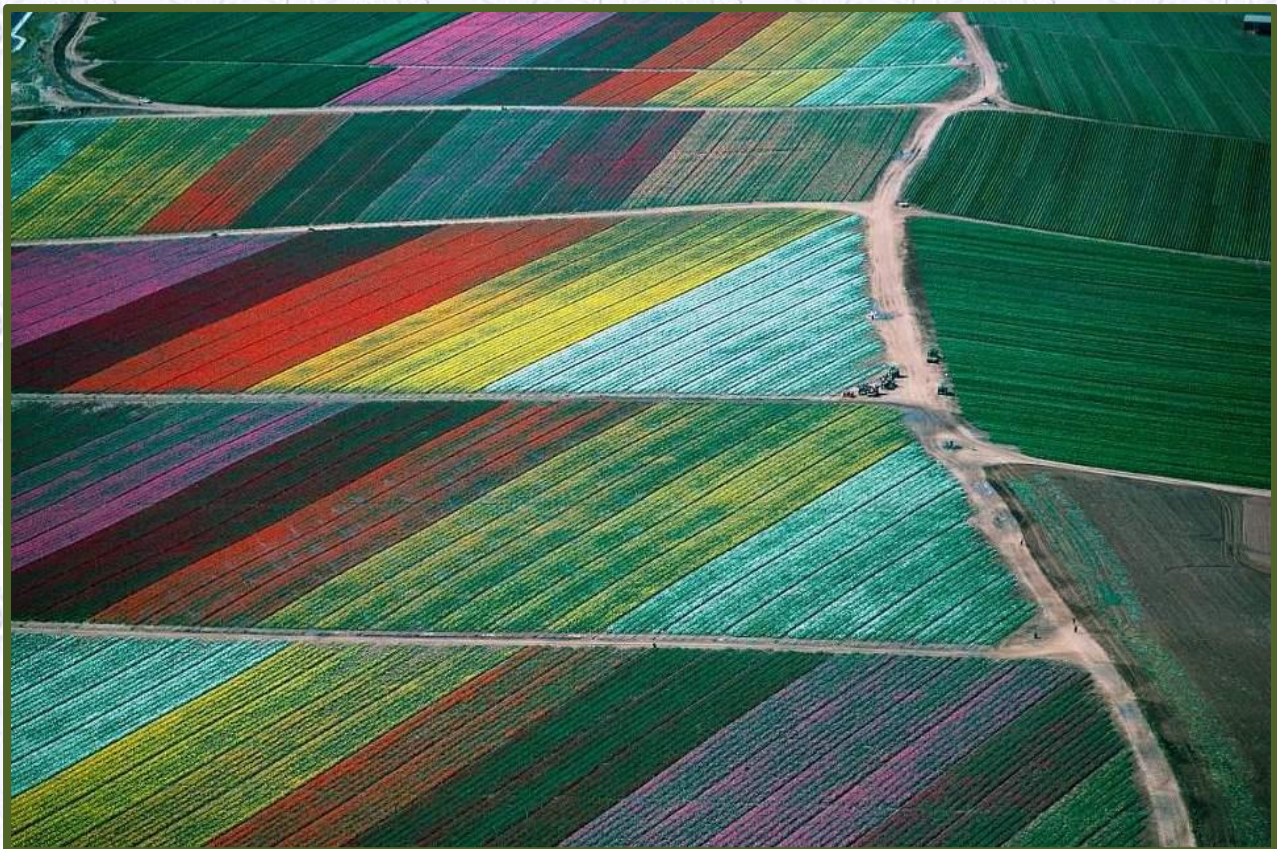
Interesting photo shows colorful flower fields near Carlsbad in California